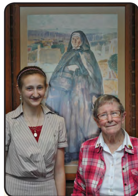
Members of the Association Jeanne Jugan are an extension of the Little Sisters' hands and hearts.

The Association Jeanne Jugan is open to Catholic men and women aged 18 years or older. Members are retirees, professionals, stay-at-home moms, and young adults who participate in the Sisters' apostolate in different ways each according to his or her talents, interest and family/professional obligations.